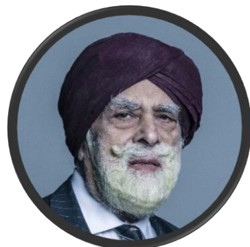
Lord Singh of Wimbledon Crossbench member of the House of Lords