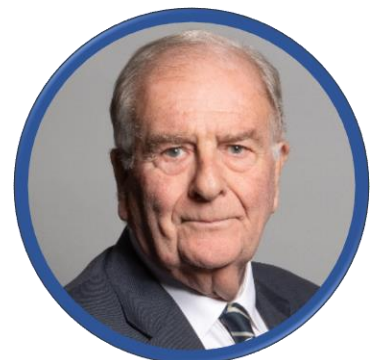
Sir Roger Gale MP Conservative MP for North Thanet