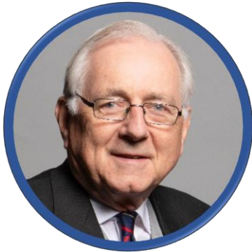
Sir Peter Bottomley MP Conservative MP for Worthing West

This parliamentary roundtable was attended by the following parliamentarians from across the political parties: