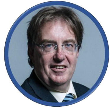
John Howell MP Conservative MP for Henley