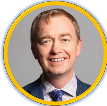
Tim Farron MP Liberal Democrat MP for Westmorland and Lonsdale