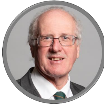
Jim Shannon MP DUP MP for Strangford