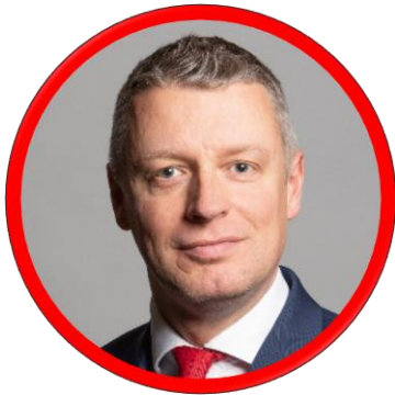
Luke Pollard MP Labour MP for Plymouth, Sutton, and Devonport