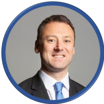
Brendan Clarke Smith MP Conservative MP for Bassetlaw