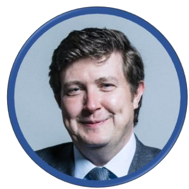
Andrew Lewer MP Conservative MP for Northampton South