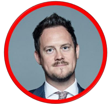
Stephen Morgan MP Shadow Minister for Schools