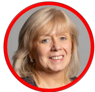
Mary Glendon MP Labour MP for North Tyneside