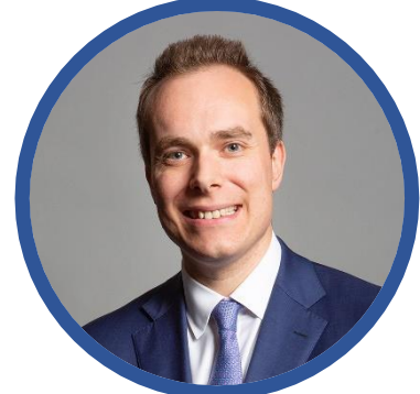
David Johnstone MP Conservative MP for Wantage