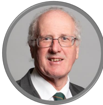
Jim Shannon MP DUP MP for Strangford