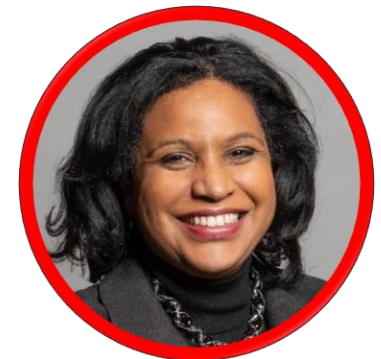
Janet Daby MP Labour MP for Lewisham East