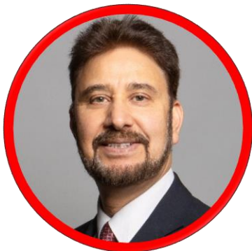
Afzal Khan MP Labour MP for Manchester, Gorton