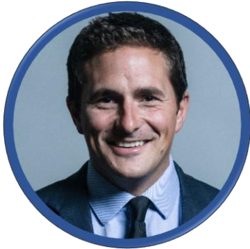
Johnny Mercer MP Conservative MP for Plymouth Moor View

This roundtable also received interested from the following parliamentarians who were not able to attend due to prior commitments. They have received the meeting summary and follow up materials.