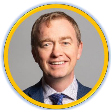
Tim Farron MP Liberal Democrat MP for Westmorland and Lonsdale

On the basis of our activity, the following MPs have written to the Chair of the Education Select Committee