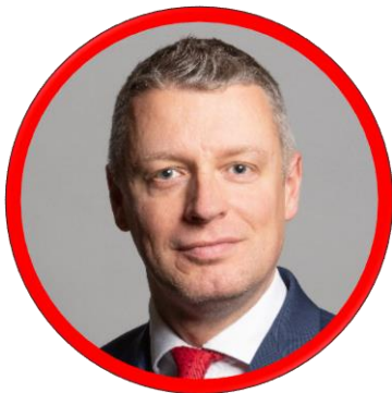
Luke Pollard MP Labour MP for Plymouth, Sutton, and Devonport