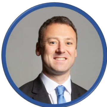
Brendan Clarke Smith MP Conservative MP for Bassetlaw