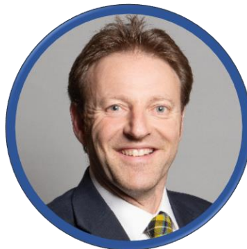
Derek Thomas MP Conservative MP for St Ives