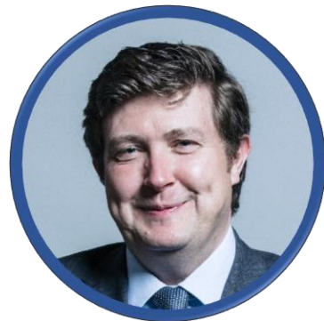
Andrew Lewer MP Conservative MP for Northampton South